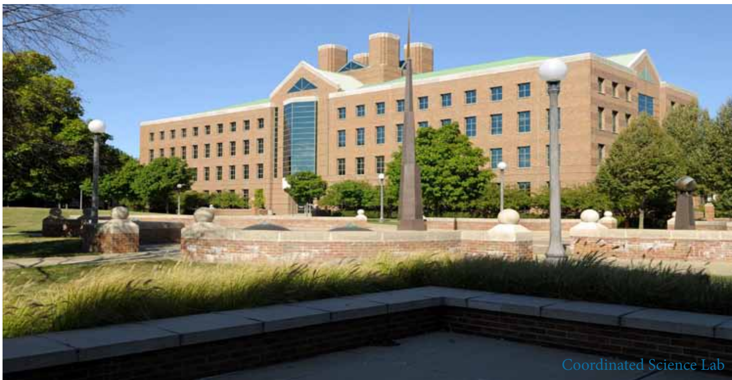
Coordinated Science Lab